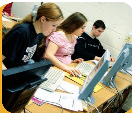
Learning computer skills at BCoT.