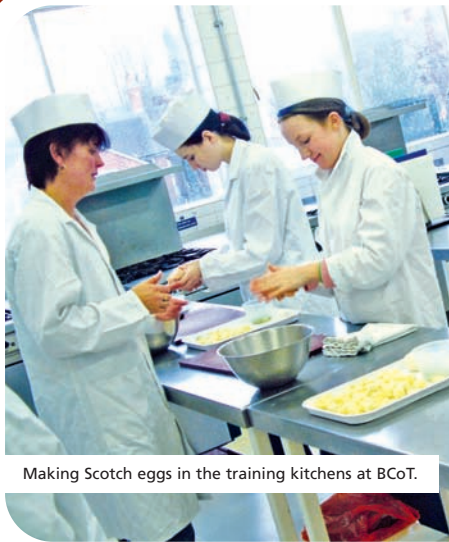
Making Scotch eggs in the training kitchens at BCoT.

I really enjoyed the environmental awareness lesson at The Orchard, (Environmental Services Offices). We cleared an area, dug holes and planted