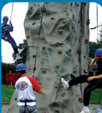
The climbing wall was a very successful activity and enjoyed by many students.

Most students soon overcame any fears and enjoyed the climbing wall as part of their induction activities.